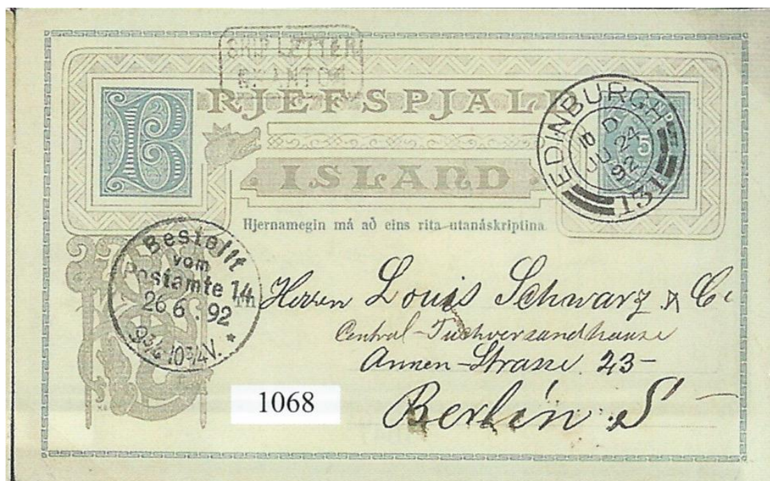
Stationary from Iceland with SHIP LETTER GRANTON and cancelled in Edinburgh JU 24 92 (twin-arc 10.1.3 6 - with bar cut). Arrival cancellation in Berlin 26. JU 92.