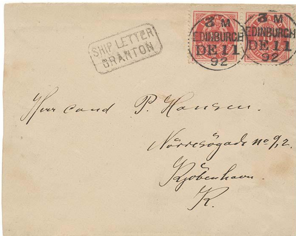
Letter from Iceland to Copenhagen. SHIP LETTER GRANTON and the stamps are cancelled with two round Edinburgh DE 11 92.