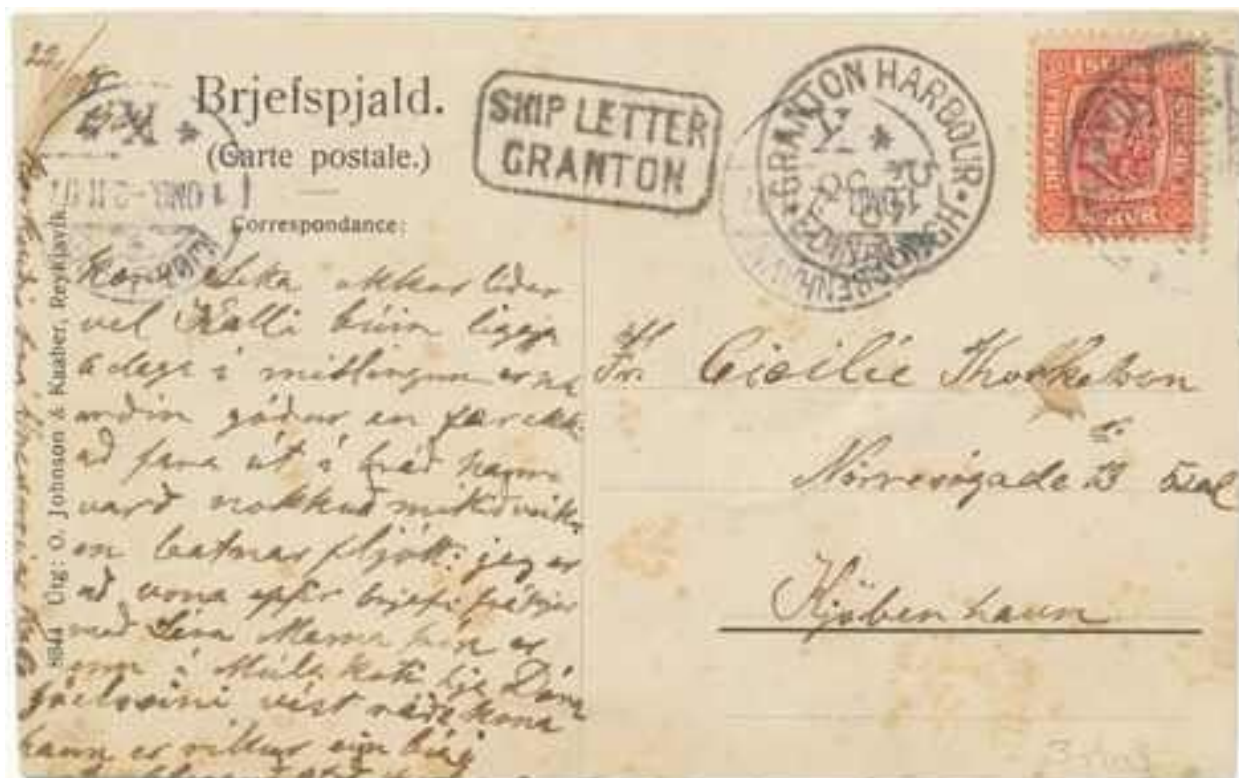
Stationery with 10 Aur red from Reykjavik to Copenhagen. Transit canc. with GRANTON HARBOUR EDINBURGH postmark as well as "SHIP LETTER GRANTON". Copenhagen arrival cancellation 2. November 1907.