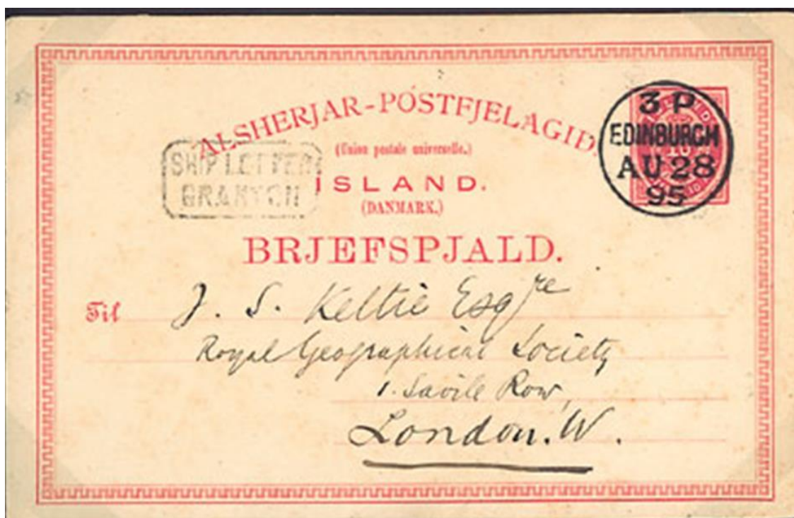
Stationary from Iceland to London. Transit SHIP LETTER GRANTON and cancellation round Edinburgh AU 28 95 (stampers number 3).