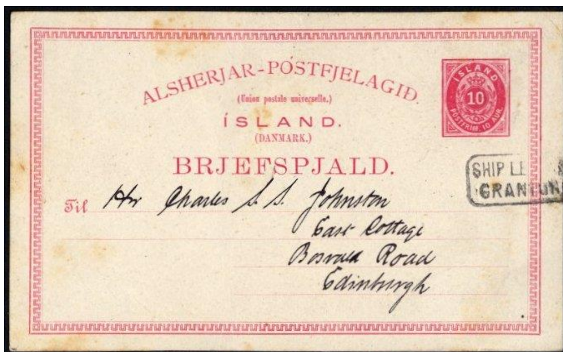
Reykjavik 16.10.1895: 10a stationary to Edinburgh (uncancelled at Reykjavik and at arrival in Edinburgh – but addressed to Edinburgh). Transported by LAURA leaving 17.10.1895 to Granton.

The last registered use until 1907 of SHIP LETTER GRANTON.