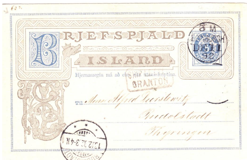
Postal stationery with missing 5 aur stamp. Written in Reykjavik 3.12.1892. SHIP LETTER GRANTON and cancelled with the round Edinburgh DE 11 92 (stampers number 3). Arrival in Thüringen, Germany, 13 December 92.