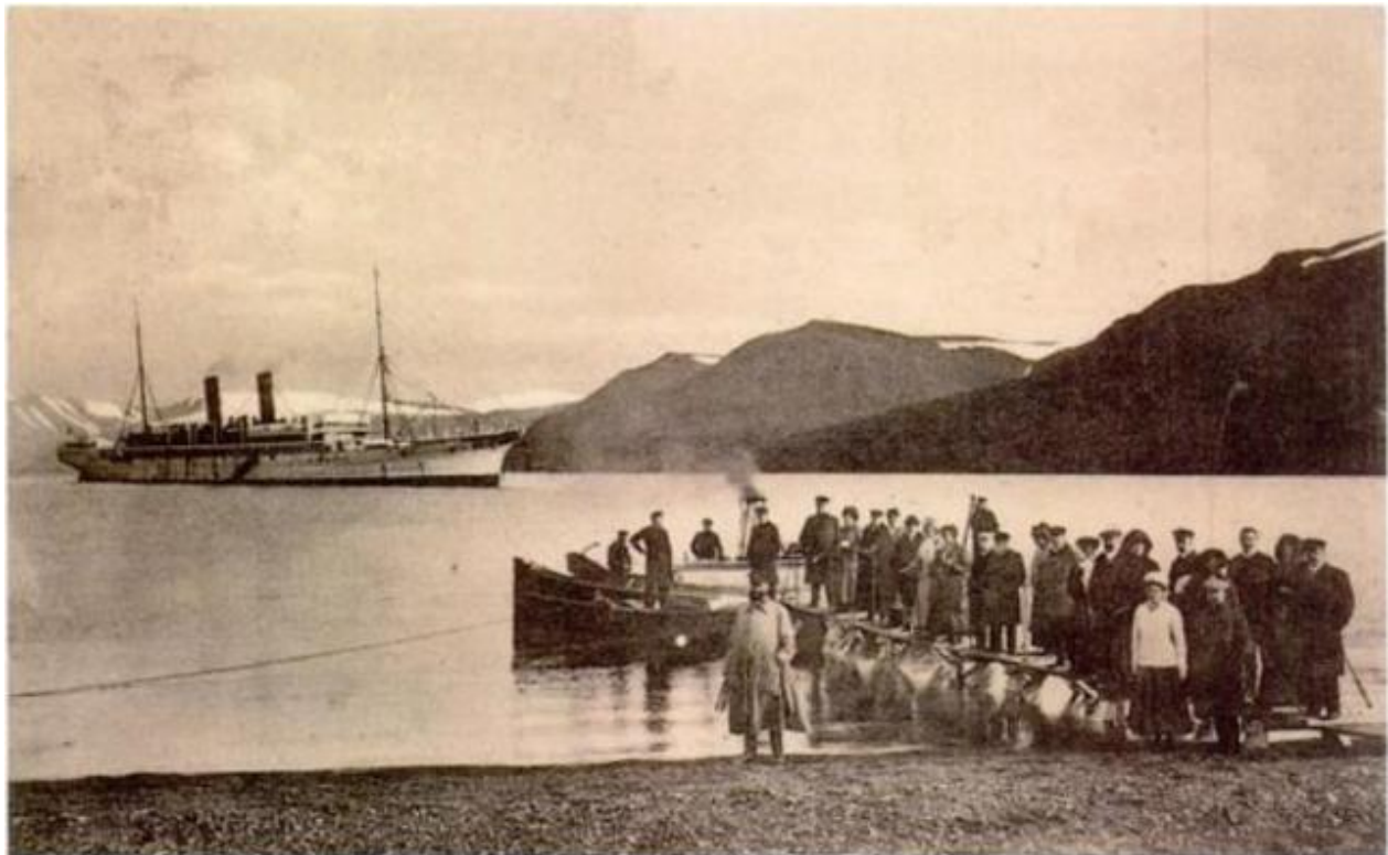
The "Oceana" in Adventfjorden.

And going back she arrived in Reykjavik 11th of July 1909 and SS MODESTA took over carrying the mail from the passengers via Adrossan. Quite a lot of mail was sent July 11